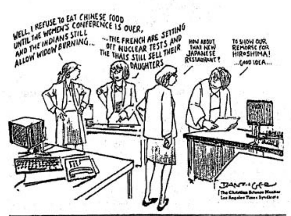
חראים International Herald Tribune, Hong Kong, August 18, 1995.